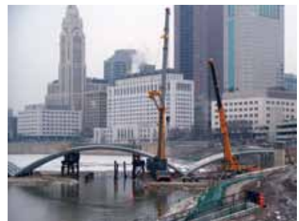
Snow flurries did not stop construction of the top segment of the rib arch on the Rich Street Bridge.