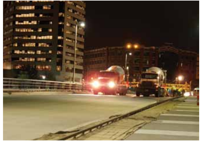
Placement of the 1½-in.-thick silica fume overlay on the bridge deck.

7 ksi concrete. After the closure joints were completed, the stay-in-place forms along with the tendon ducts were installed, the reinforcing steel tied, and the deck concrete was placed. When the deck concrete reached 4.5 ksi, the beam tendons were stressed and grouted. More than 240,000 ft of post-tensioning strand was used in the arch and beam segments.