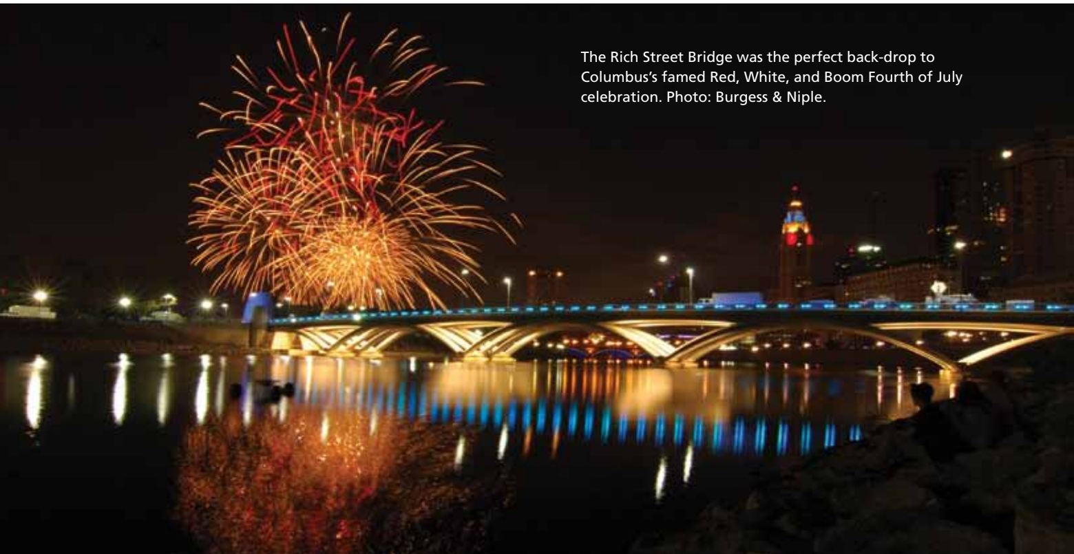
The Rich Street Bridge was the perfect back-drop to Columbus's famed Red, White, and Boom Fourth of July celebration.

The Rich Street Bridge replaces the historic concrete arch Town Street Bridge which was built in 1917.