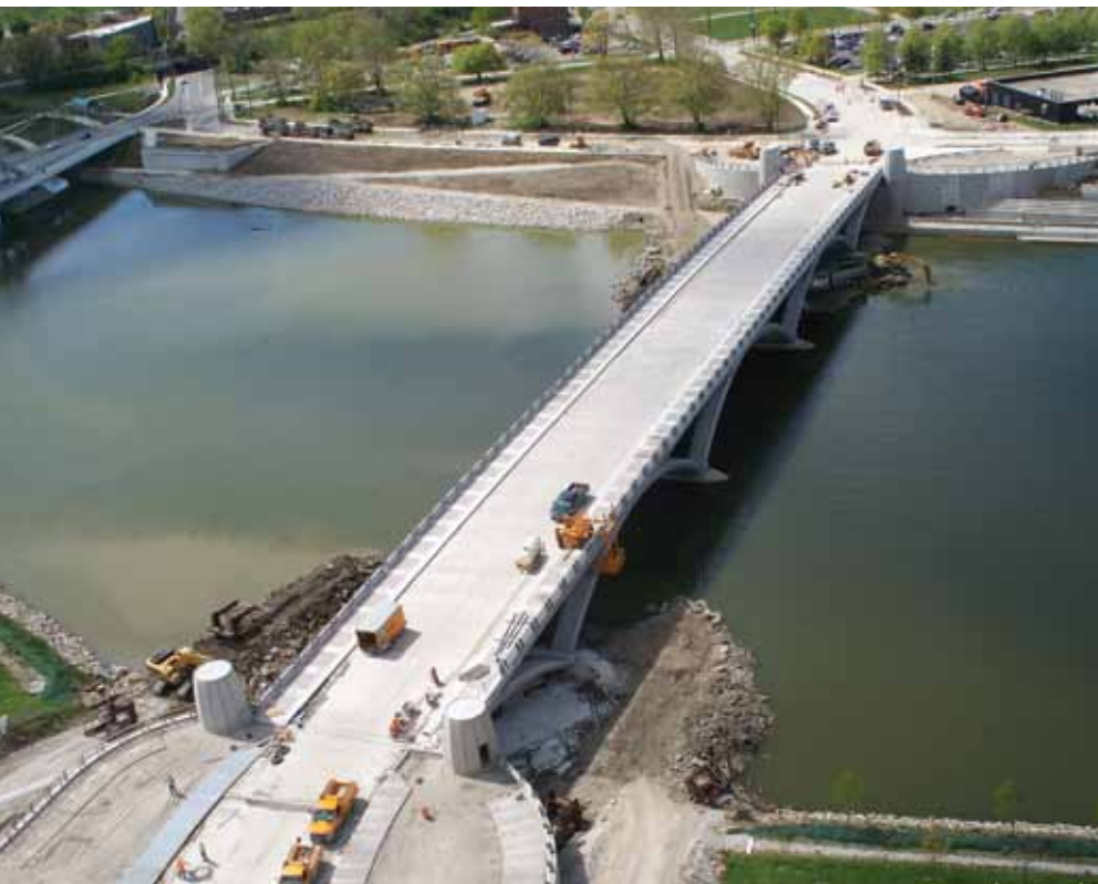
Aerial photograph after the bridge deck was placed.