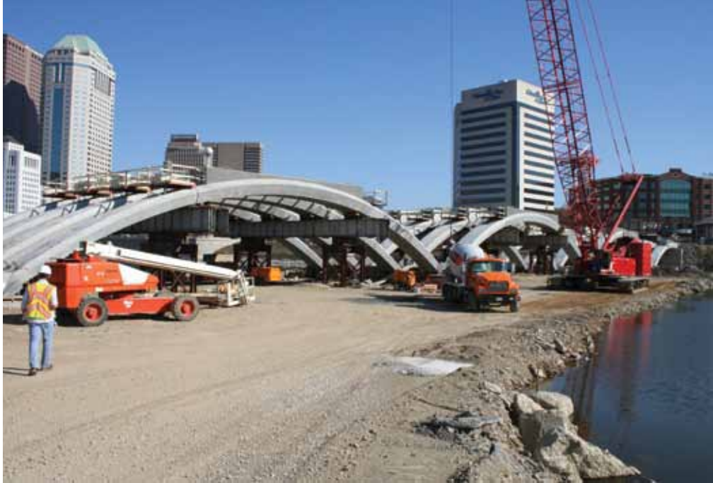
Placing the pier cap closures.

Construction began by installing a rock causeway, drilling the shafts and building the piers, and fabricating and erecting eight temporary support towers. These towers were used to piece together and stabilize the precast concrete segments during erection and post-tensioning operations. While the contractor was erecting the support