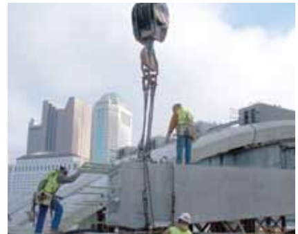
Delivery of the precast, prestressed concrete girders.

Following the inner rib tensioning operations, the eight deck segments closest to the abutments were placed on elastomeric bearing pads, and the outer rib segments were then tensioned the remaining 50%. All arch rib ducts were then grouted. The final eight deck segments spanning the middle two piers were then placed and the upper closure joints were cast using the same