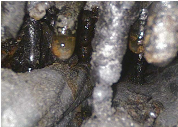
This image shows a duct with exposed tendons in the duct interior. Note the mineral and water deposits.