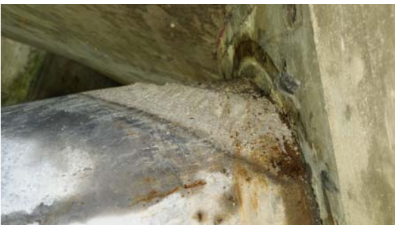
Soft grout can be seen at the anchor of the steel tendon pictured here.