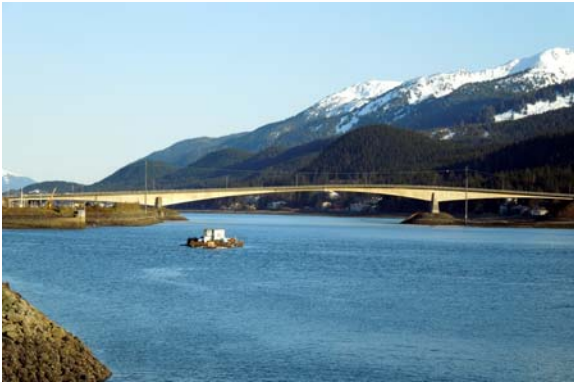
Juneau Douglas post-tensioned bridge over the Gastineau Channel in Juneau, Alaska.