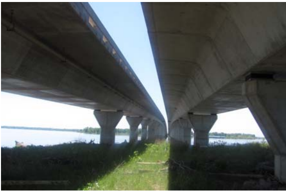
US 59 post-tensioned bridges over Grand Lake in Delaware County, Oklahoma.