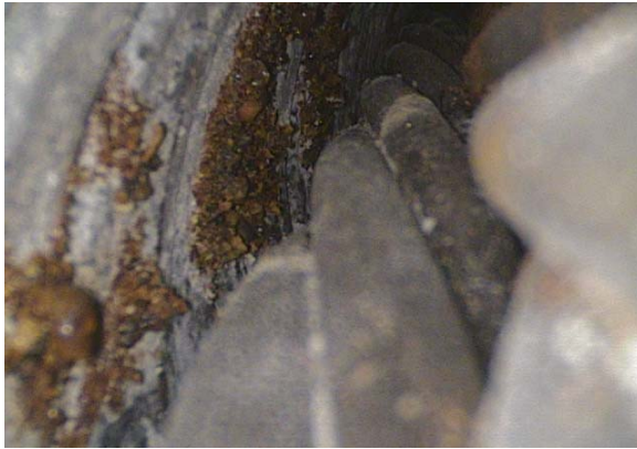
This tendon duct has no grout. Note that there is rust on the duct interior and the steel tendon strands.