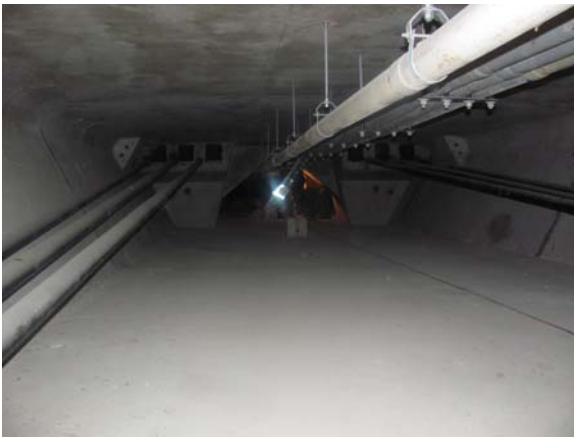
A typical view of external tendons in a post-tensioned structure.