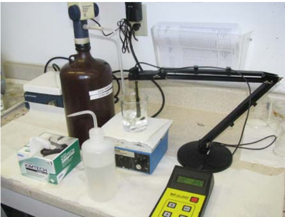
A lab titration process quantifies the chloride content in concrete and grout.

NOTE: Current Post-Tensioning Institute (PTI) and American Segmental Bridge Institute (ASBI) standards provide for maximum pressure and grout flow speeds. They now take into account the diameter of the duct and the length as well as the drape of the tendon.