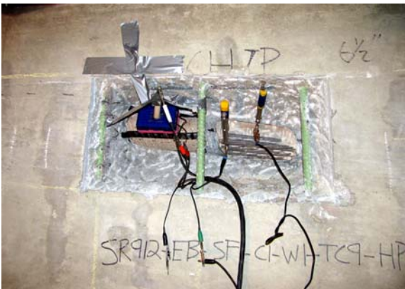
A corrosion rate setup for an interior steel tendon.

Comparing information obtained from different time periods will provide valuable insight with respect to the potential rate and location of deterioration occurring in the structure from a holistic point of view. All invasive test locations are repaired to a condition equal to or better than the original state.