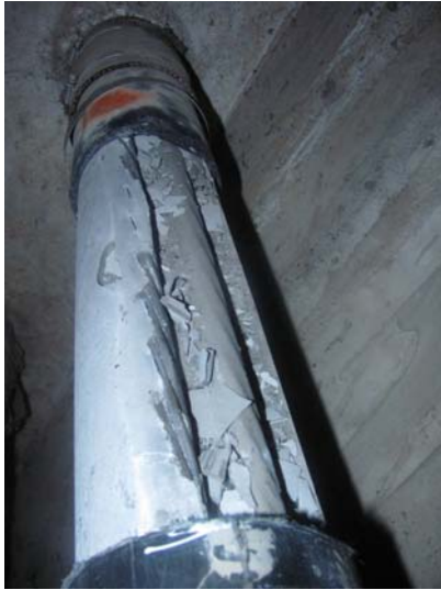
This exterior tendon has a large void. Note that the steel tendon is exposed.