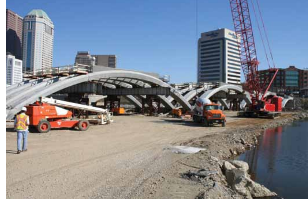
Placing the pier cap closures.

Construction began by installing a rock causeway, drilling the shafts and building the piers, and fabricating and erecting eight temporary support towers. These towers were used to piece together and stabilize the precast concrete segments during erection and post-tensioning operations. While the contractor was erecting the support