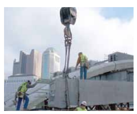
Delivery of the precast, prestressed concrete girders.

Following the inner rib tensioning operations, the eight deck segments closest to the abutments were placed on elastomeric bearing pads, and the outer rib segments were then tensioned the remaining 50%. All arch rib ducts were then grouted. The final eight deck segments spanning the middle two piers were then placed and the upper closure joints were cast using the same