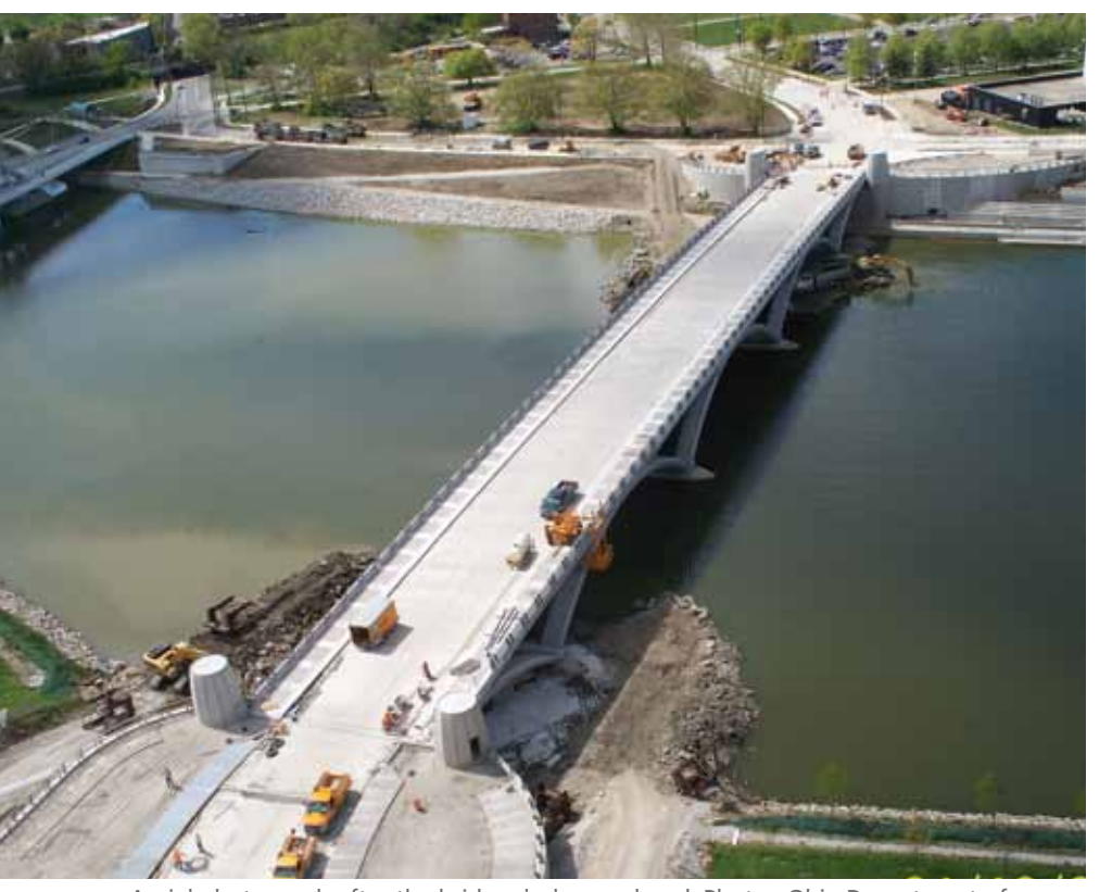
Aerial photograph after the bridge deck was placed.

For additional photographs or information on this or other projects, visit www.aspirebridge.org and open Current Issue.