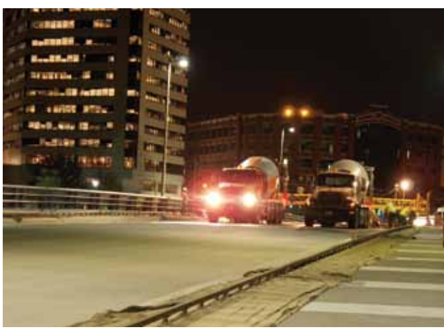
Placement of the 1½-in.-thick silica fume overlay on the bridge deck.

7 ksi concrete. After the closure joints were completed, the stay-in-place forms along with the tendon ducts were installed, the reinforcing steel tied, and the deck concrete was placed. When the deck concrete reached 4.5 ksi, the beam tendons were stressed and grouted. More than 240,000 ft of posttensioning strand was used in the arch and beam segments.